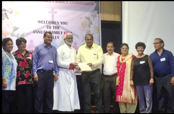
Parish Family Cell wins Award