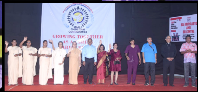
Parish Family Day 2019